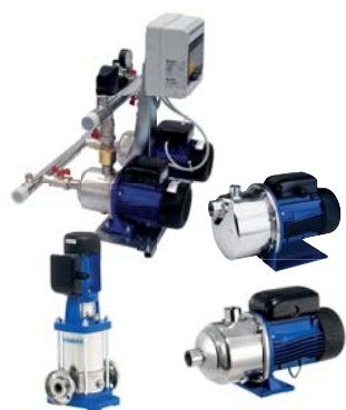
PRESSURE BOOSTING PUMPS