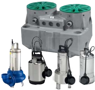
DRAINAGE/ SEWAGE PUMPS

Q-Smart single-phase electronic control panel intended to be used with 1 or 2 single phase electric pumps within different fixed speed systems. Over 50 different combinations available within this one product that can be used for controlling pressure boosting or sewage applications.